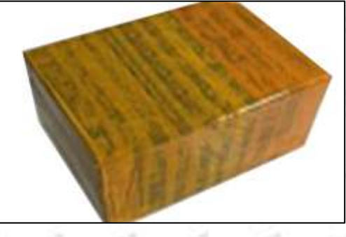
Pic No. 3 International express packaging: Wrapped with yellow tape after wrapping black protective film